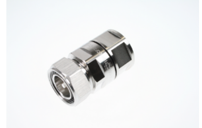
OMNI FIT™ Standard Connectors

OMNI FIT™ high performance connectors are designed for use with both CELLFLEX® (copper) and CELLFLEX® Lite (aluminum) cables. They are designed specifically to provide the highest quality connector-cable interface while simplifying and speeding up connector attachment. All RFS connectors are fully tested for mechanical and electrical compliance to industry specifications. The 7-16 connector is the most rugged RF connection meeting all requirements even under the most severe environmental conditions.